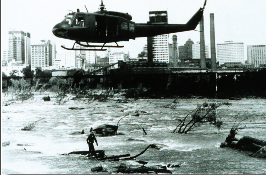
Virginia National Guard helicopter rescuing an individual from the James River. Note: rescued man halfway up to helicopter. Helicopter crewman standing on debris in river.

"Fifteen years ago, storms battered the West Coast of the United States...There were droughts in Australia, Indonesia, and India...Worldwide, 2,000 people died...Economic losses amounted to billions of dollars...In Indonesia and Borneo, dry conditions fed raging forest fires that consumed hundreds of thousands of acres. Smoke blanketed the area..."