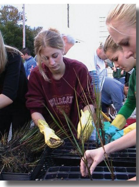
Students in the Tampa Bay area grow marsh grasses and seagrasses, and assist with monitoring and planting to restore damaged habitats.