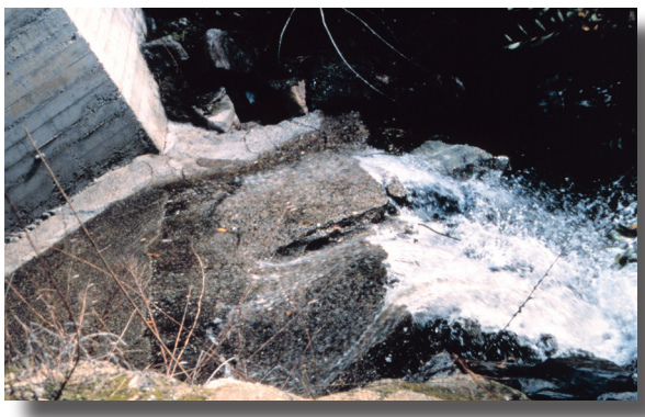
Adobe Creek in Sonoma County, California was once alive with salmon and steelhead trout; but after years of pollution and neglect, state officials declared it "dead."