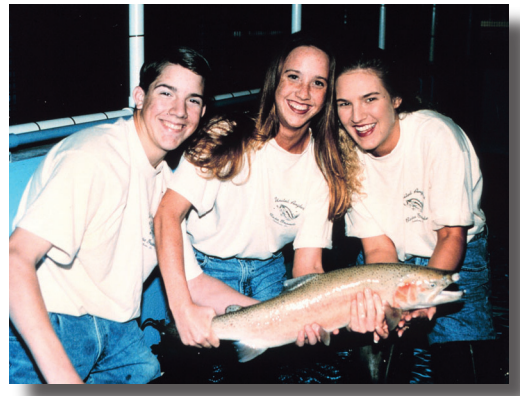
Students at Casa Grande High School built the only student run fish hatchery in the lower 48 states, removed trash from Adobe Creek, planted trees, so that Steelhead and Chinook salmon are once again spawning in the steam.