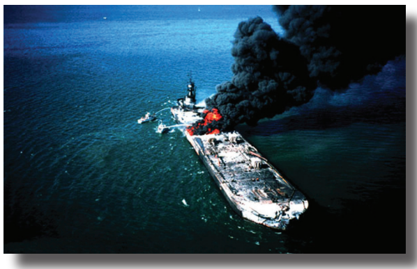
Seagrasses provide food and habitat for different species of fish, lobster, wading birds, manatees and sea turtles. In Tampa Bay, more than 70 percent of seagrass meadows have been destroyed by pollution, coastal development, dredging, and boat propellers.