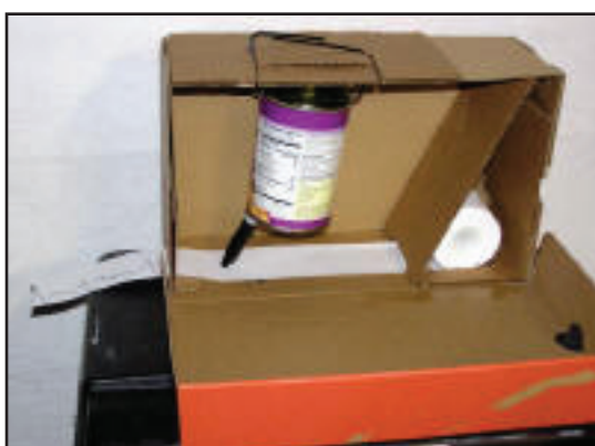
Right: Photographs of an actual Model Seismograph taken at an NSTA meeting in 2002. The upper is viewed from the back, keeping the mystery of the internal workings.