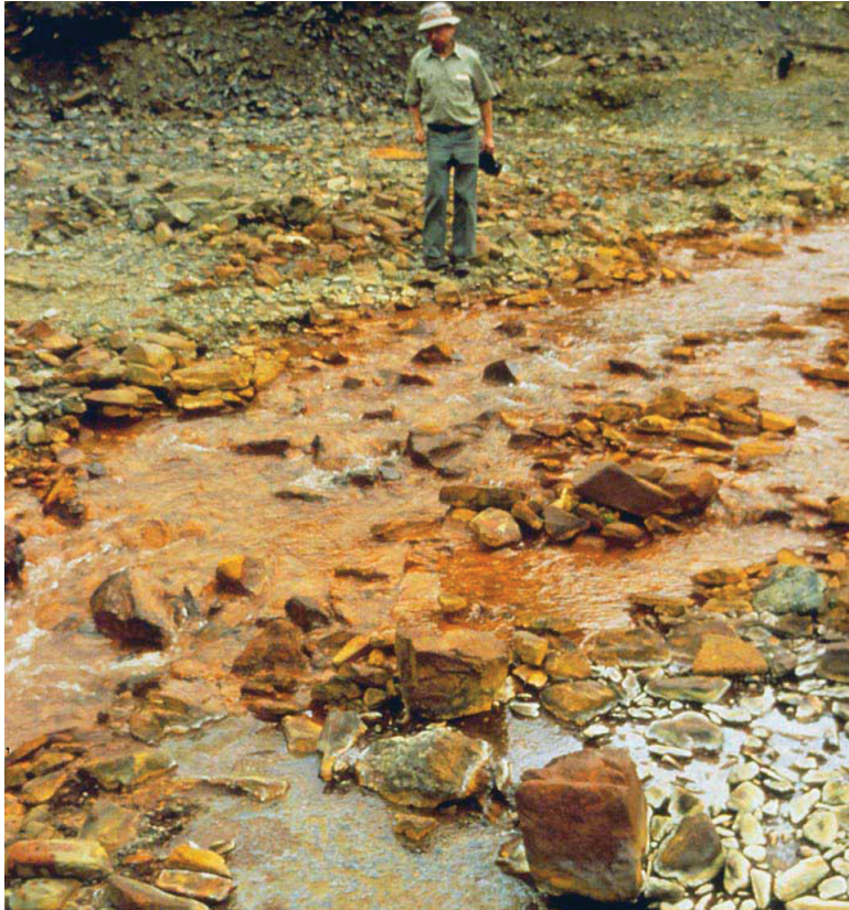
Iron contamination in the Idaho Blackbird Creek, Lemhi County, Idaho.